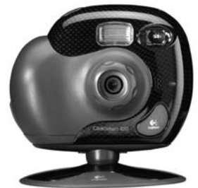
QuickCam ® ClickSmart™ 420